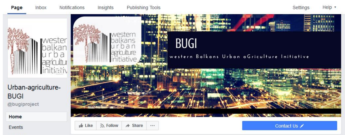
Picture 5. BUGI Project Facebook page